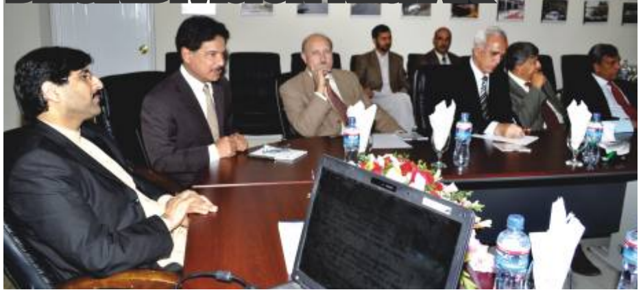
New Chairman ERRA being briefed by VP DM&R

Hamid Yar Hiraj, the new Chairman of the Earthquake Reconstruction and Rehabilitation Authority (ERRA), along with his key staff visited the Disaster Management and Reconstruction Division, NESPAC, on December 10, 2010.