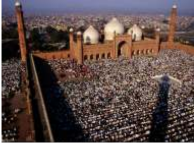
Badshahi Mosque, Lahore

Lahore, the city of gardens and educational institutes is the second largest city in Pakistan with a population of nearly 7 (seven) million. This historical city is located near the River Ravi and is the capital of the Punjab Province. Apart from being the cultural and academic center of the country, Lahore is the Mughal “Show-Window” of Pakistan. Beautiful gardens, historical forts, mosques and shrines, Mughal architectures and museums, fairs and festivals all add-up to make Lahore a city loved by all. There are ample destinations of tourist interest in Lahore that makes it a city worth visiting.