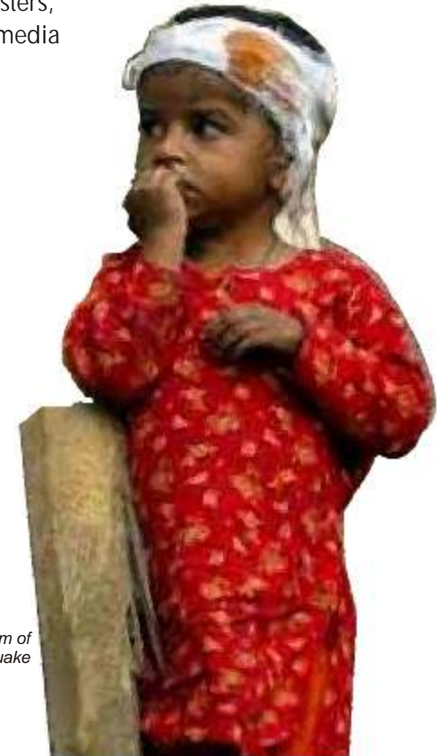
An innocent victim of earthquake