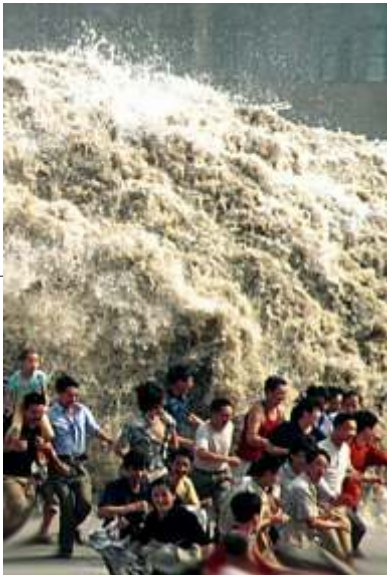
Havoc caused by Tsunami in Thailand