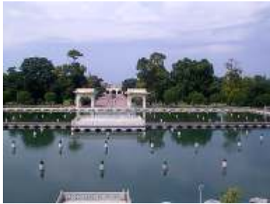
Shalamar Garden, Lahore

On the occasion of the Conference, a souvenir would be published containing messages from dignitaries, articles on the theme topic and advertisements.