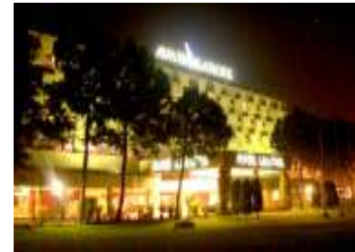
Hotel Avari, Lahore

A delegate, foreigner or local may stay at his/her own arranged accommodation, however, whereabouts of such arrangements shall be intimated to the Conference Secretariat. In such case, the delegate is to pay only Registration Fee. ACEP has negotiated with Hotel Avari (five star hotel) which is also the Conference Venue, a special four nights package as accommodation charges inclusive of all taxes as above. Accommodation charges include complementary breakfast and airport pick and drop facilities. Number of rooms for such package is limited and will be offered to persons on first cum first serve basis through the Conference Secretariat. Upon reservation of the allocated rooms, guests will be offered alternate accommodation on the same charges.