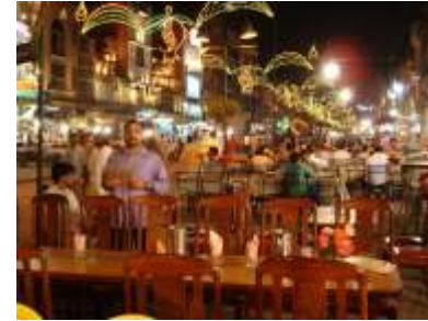
Food Street, Lahore

Registration details for the local delegates are provided in the Registration for Local Delegate form. Registration fee for the local delegates and their accompanying spouses will cover 3 days conference lunch, refreshments and conference materials only. If they intend to avail other benefits like gala dinner, technical tour etc; they are to pay actual costs thereof to be obtained from the Conference Secretariat. Local delegates, if intend to avail ACEP arranged accommodation, shall have to pay additionally at the same rate stated above.